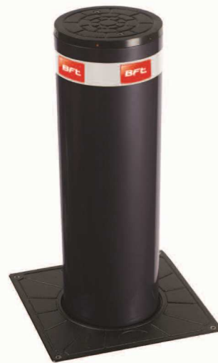
STOPPY B Ø200/700