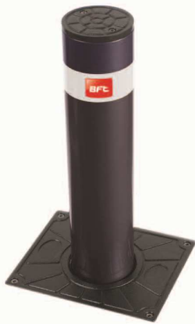
STOPPY B Ø115/500

→ Value for money and quality. These are the roots of the new STOPPY B bollards. The result of a careful market survey looking into the assembly techniques and design details that led to the production of a simple bollard that responds to customer needs without neglecting the quality requirements that have always marked BFT products. All at a competitive price. STOPPY B comes in two models: the first, STOPPY B Ø115-500, has a Ø115 mm, 500 mm high rod. It has no light crown but is fitted with a rear-reflecting strip. The second, STOPPY B Ø200-700, has a Ø200 mm, 700mm high rod, a light crown and a rear-reflecting strip.